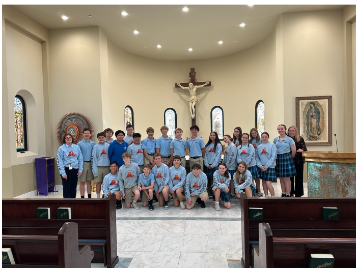
8th grade toured the diocesan pastoral center and had Mass and a tour of St. Mary's Basilica on downtown Phoenix.