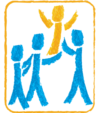
The Matthew 19:14 Project

Last school year, ACS received two mini-grants from the Matthew 19:14 Project at the Diocese of Phoenix. The Matthew 19:14 Project was first established in 2014 as the Arizona Catholic Schools Disabilities Fund (ACSDF). Its new title refers to the scripture quote, “Let the little children come to me and do not hinder them, for the kingdom of heaven belongs to such as these.” The goal of the project has always been simple – to provide Catholic schools in Arizona with the funding, resources they need to properly accommodate and serve students with special needs.