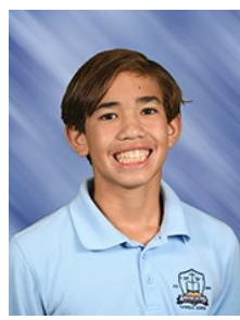
Joseph LaChapelle Brophy College Prep